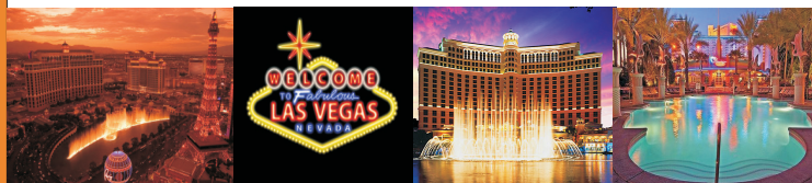
Las Vegas Strip

(*excl NAR registration, subject to change due to exchange rate)